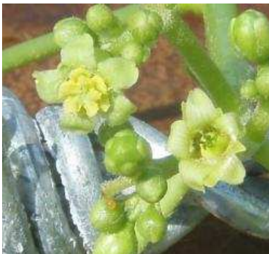
Male (left) and female flowers of an Jatropha inflorescence

The picture above shows the end of a branch of such a high yielding plant. Until the middle of the rainy season, the plant (about 3 years old) produced already 2.8 kg of seed. So the total yearly yield of this plant can be estimated at about 5 kg (more than 4 kg). With a density of about 1,300 plants per ha (2.5 m distance between the plants in a row, and 3 m distance between the rows), this amounts to about 5 tonnes of Jatropha seed per ha, a value; which