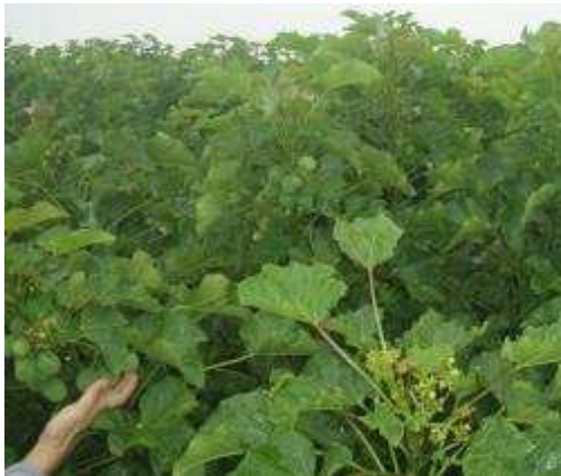
Quite high yielding plants from seeds in Cambodia (Canada Bank plantation)

During a Jatropha conference in Wageningen in the Netherlands (March 2007), the Jatropha experts of different countries around the world agreed to a yield of 4 to 5 tonnes of seed per ha and year.