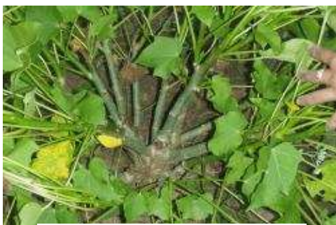
Twice pruned young Jatropha plant with many branches

The idea is, that the pruning of the plants will keep them low enough to facilitate the harvest of the fruits, because the time needed to harvest a certain number of kg of seeds, is a very important factor of the economic feasibility of Jatropha oil production (see next point Nr. 4).